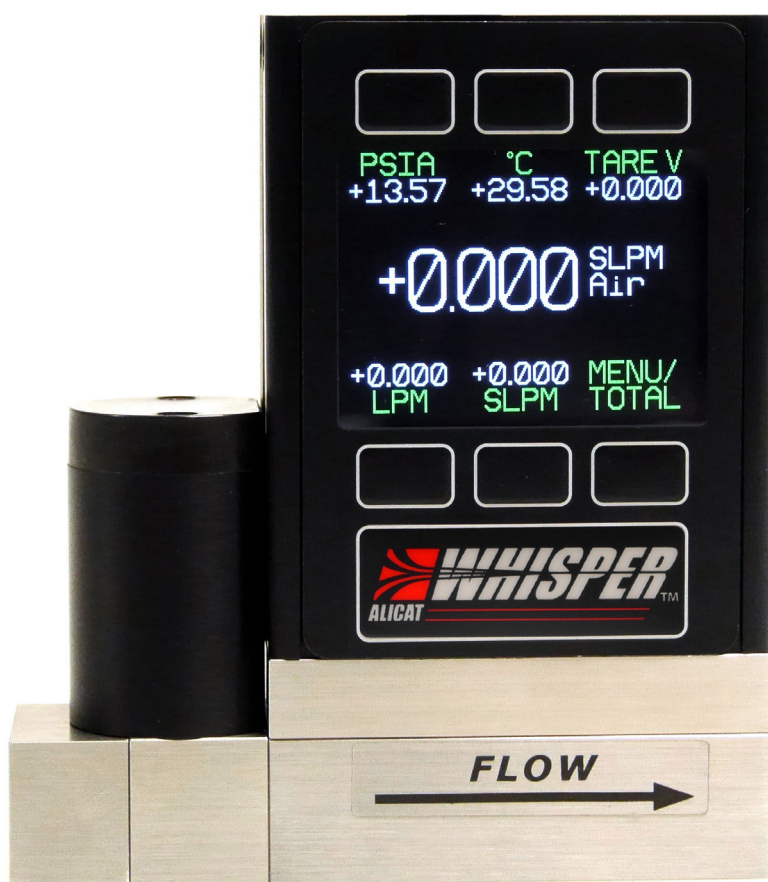
MCW "Whisper" Mass Flow Controller