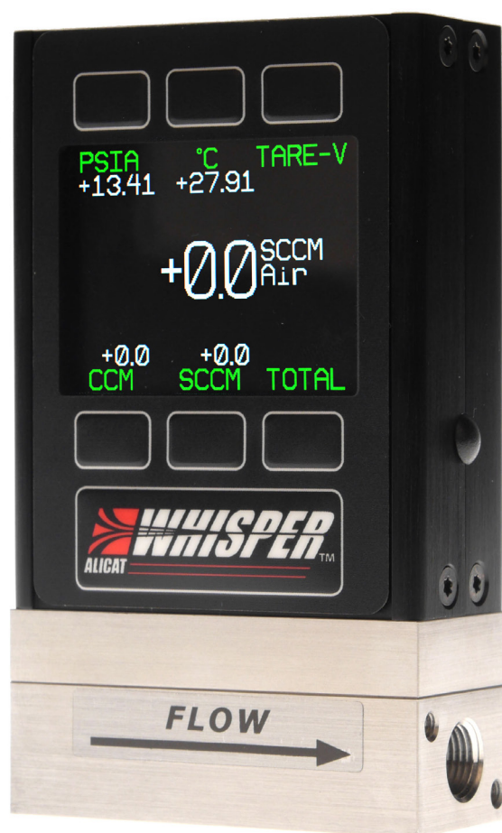
MW "Whisper" Mass Flow Meter

The Fastest Flow Controller Company in the World!