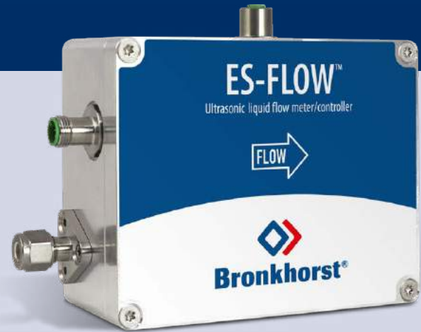
ES-113C Ultrasonic Liquid Flow Meter

Liquids can be measured independent of fluid density, temperature and viscosity, therefore recalibration per fluid is unnecessary. The flow meter has a straight sensor tube design with the actuators positioned at the outer surface. Therefore, the instrument is easy to clean. All wetted parts are made of stainless steel, build in an aluminium housing. The on-board PID controller can be used to drive a control valve or pump, enabling users to establish a complete, compact control loop.