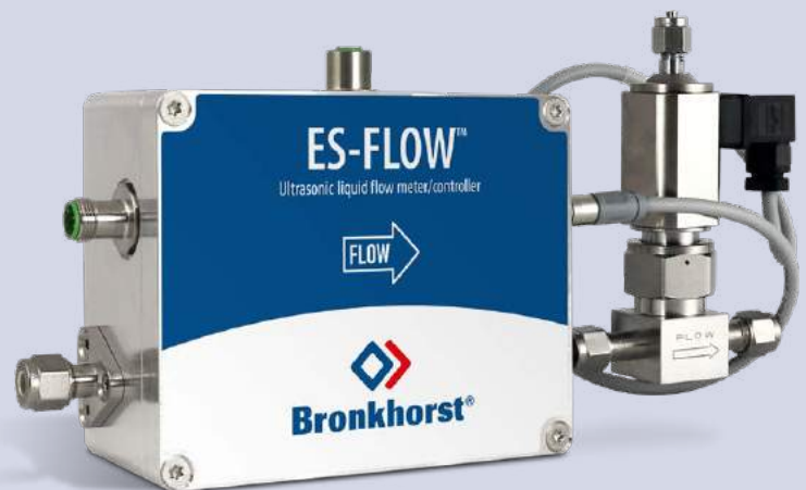
ES-113C/C21 Liquid Flow Controller